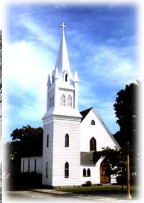
TRINITY CHURCH NOW