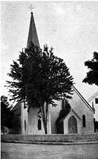
TRINITY CHURCH 1882